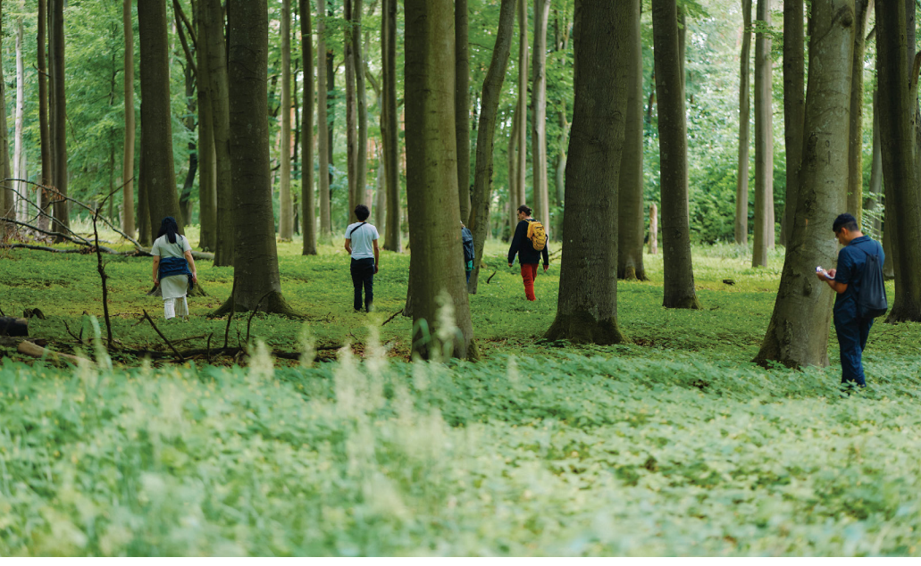
Transmediale Summer Camp in the Forest x Artsformation (2021)

An inclusive urban regeneration aims to promote an inclusive public space situated at the centre of the challenge of doing and living the city as an open system where diverse values, cultures, religions and ethnicities converge. This open and democratic character needs to be