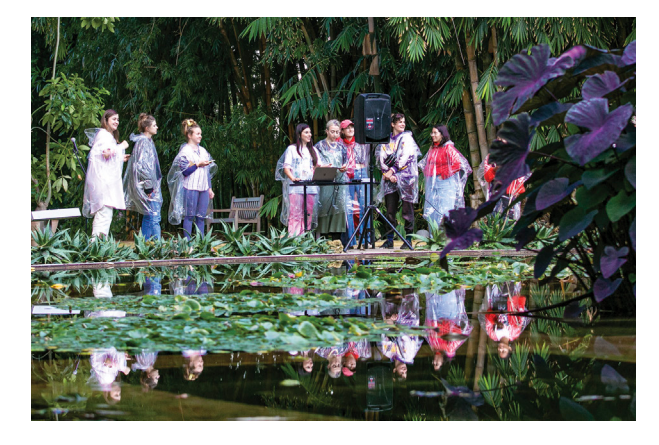
Room to Bloom session in Palermo with artists, 2021.

As cultural managers and curators, we are aware that decolonising ourselves and the cultural production sphere is part of the journey towards decolonising the spaces we inhabit.