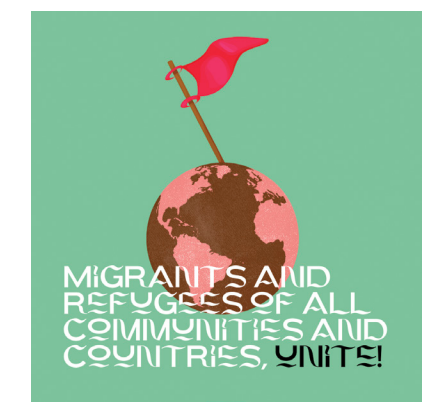
Sharepic created for the Migrant Organizing Toolbox

methods and techniques to unite for a future of solidarity and together strengthen frontline communities that have been marginalized and whose political struggles have been ignored for far too long. Ironically, we started it on the 60th anniversary of the guest worker agreement between Germany and Turkey and in parallel to the frustrating experience of the Conference\ on the Future of Europe which does not give a strong voice to marginalised communities when it comes to decide on the future of Europe.