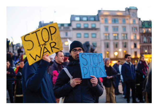
Antiwar demos have popped up around the world, like this one in London (UK), protesting Russia's invasion of Ukraine.