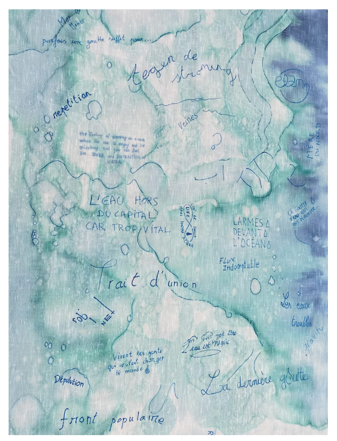
Simon Auperpin, Fluctuations Festival Brussels, 2024

1. Emma Haziza : Comment nous avons brisé le cycle de l'eau, Déclic-Le Tournant, La Première RTBF, émission du 30/08/2023