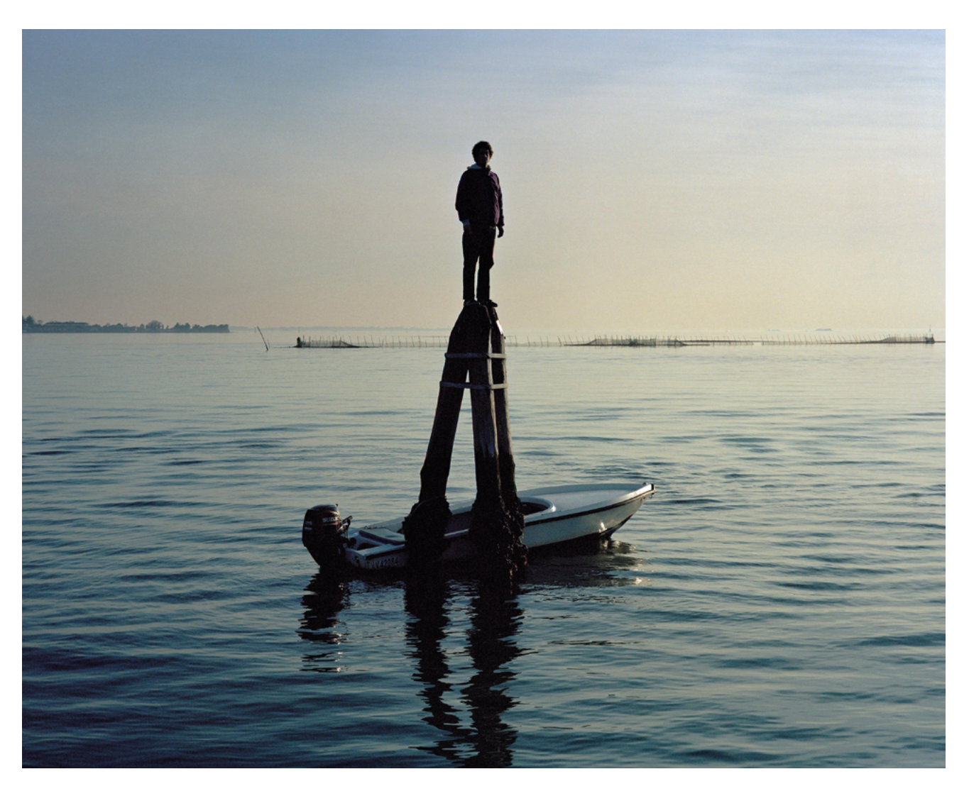
Toto, 2024.

in 2021, cruise ships were banned from the Giudecca Canal thanks to years of collective action and campaigning from Comitato No Grandi Navi and its comrades.