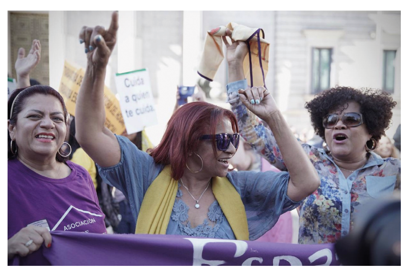
Photo of Territorio Domestico when Convention 189 was ratified in Congress.

labor, particularly migrant women. These unions remain rooted in outdated structures, not reflecting the changing dynamics of labor under capitalism. The real force has come from social movements, especially migrant women themselves, who have organized outside of these traditional frameworks.