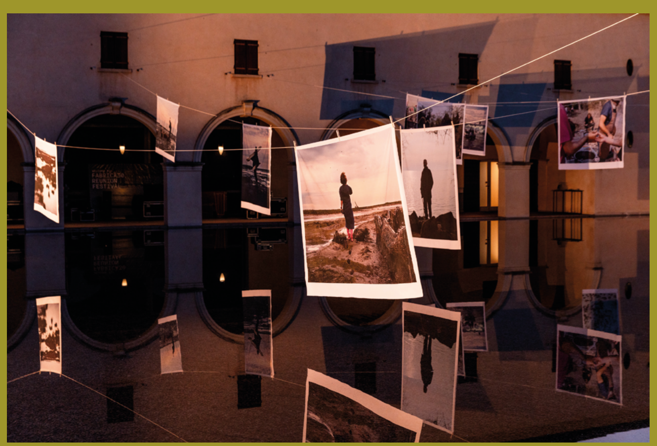
La Laguna Resiste installation exhibited at the Fabr Research Centre as part of the Kinship Exhibition .