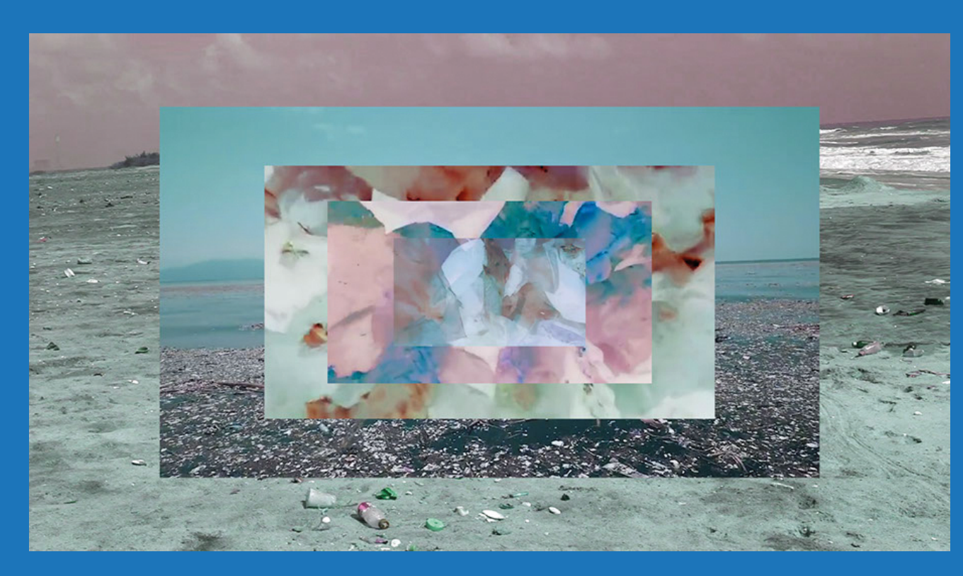
Kati Roover, still from film Flowing Place, 2017.

This extract comes from my first book, The Hydrocene: Eco-Aesthetics in the Age of Water (Routedlge, Environmental Humanities Series, published 2024). In the context of Undercurrents we share here some ways of relating to water as an embodied agent and part of the circulating hydrosocial cycle. Starting with the idea of the planetary as research context and the centrality of water within the climate crisis, in this extract the theory of the Hydrocene as disruptive epoch emerges. With thanks to Routledge, UNSW, and the Australian Government RTP Research Scholarship support. The Hydrocene: Eco-Aesthetics in the Age of Water is available for purchase, and the e-book is fully open access.