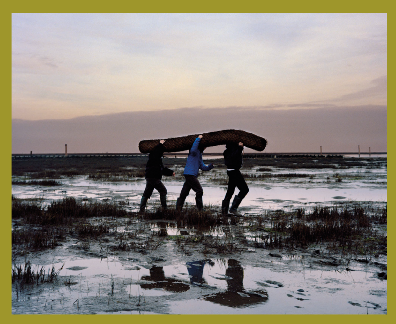
We Are Here Venice (WahV) doing conservation work on an artificial barena as part of the EU WaterLANDS project, 2023.

Engagement has been a core principle of this project.